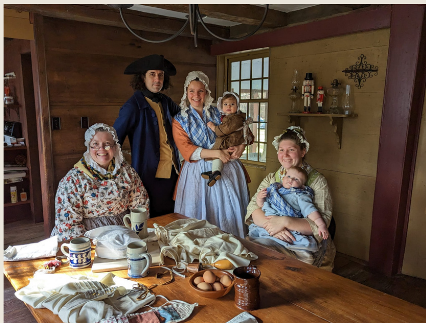
Members of the Col. Hinsdale Garrison at the 2022 Christmas Open House

The Christmas Open House will be on December 9th at 10am, with a rain date of December 16th. We have asked the Col. Hinsdale Garrison re-enactment group to come and set up in the house again for the open house this year.